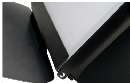
Magnetic Gel/Diffuser Holder