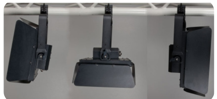
Optional 180° Dual Yoke / Bracket

Specifications are subject to change without notice ©Elation Professional 07/31/16